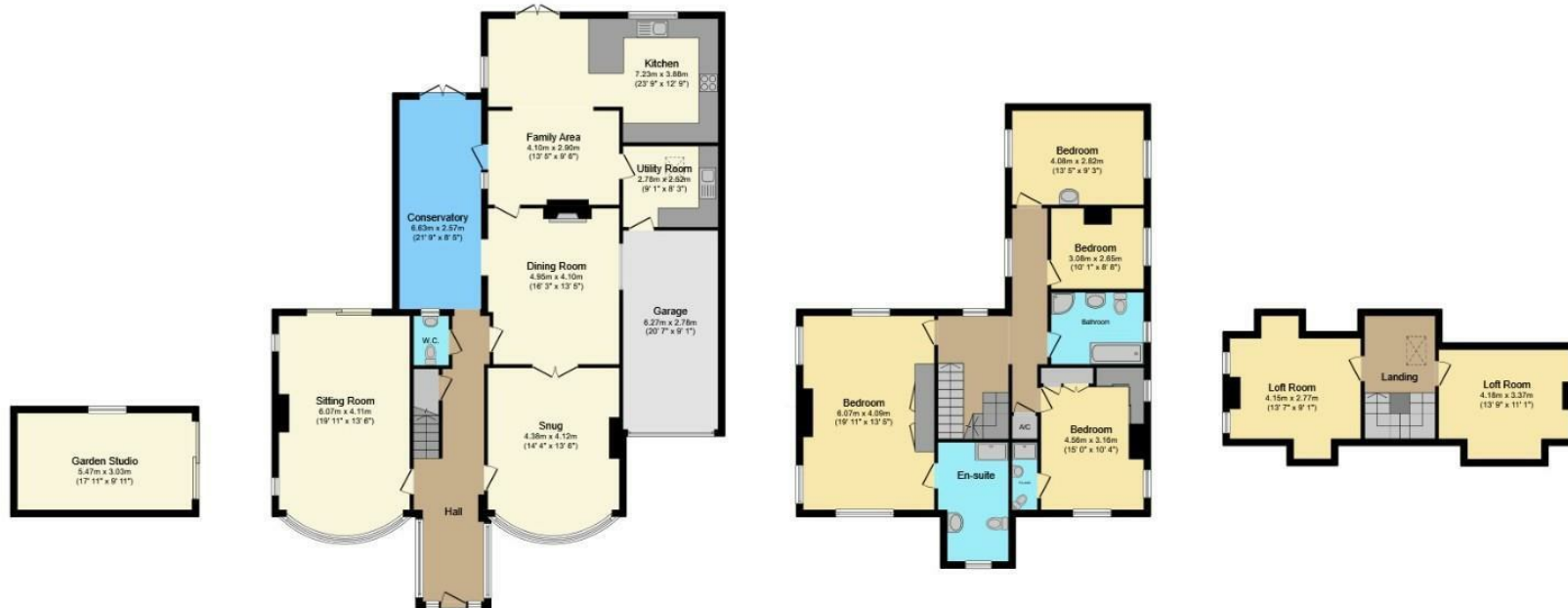
Studio Floor area 16.6 sq.m. (178 sq.ft.)